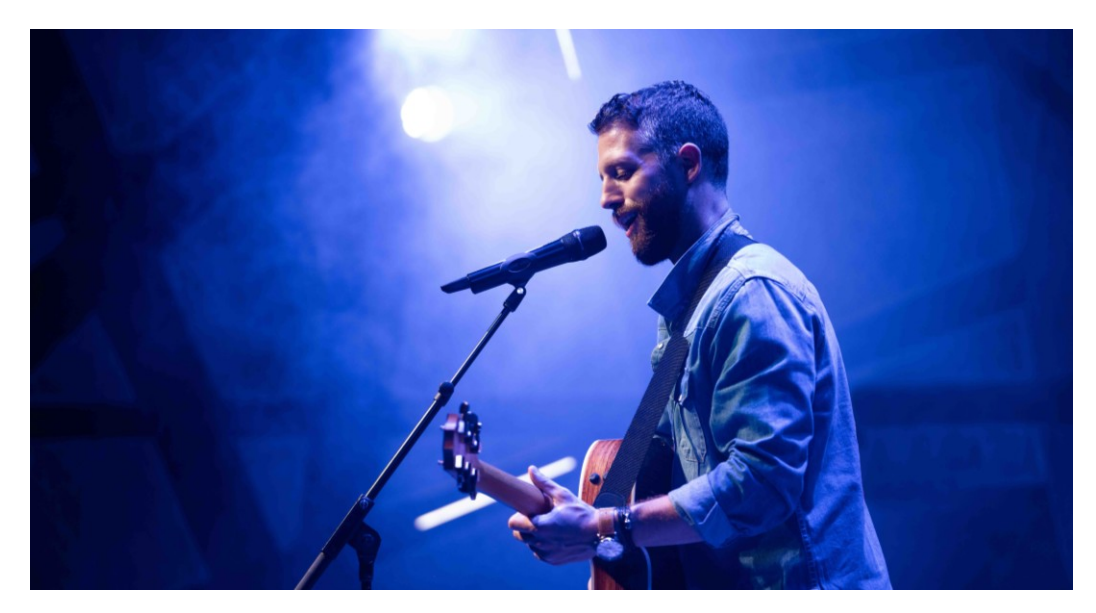
Five stars for a reason — Limited-time deals for Sennheiser EW-D wireless systems

Stand a chance to win a pair of limited 80th anniversary edition Ruby Red HD 25