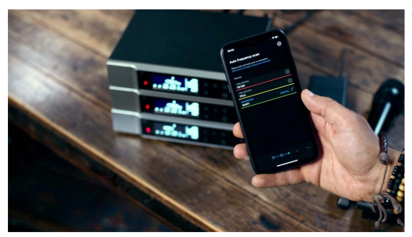
The Smart Assist app makes setting up a wireless system a breeze

The Evolution Wireless Digital EW-D series was designed to make wireless as easy as using an app — and has garnered 5-star reviews about its pristine audio quality, rock-solid reliability, and the worry-free Smart Assist app, which takes over the tedious job of setting up the wireless for a gig, and helps in monitoring and troubleshooting.