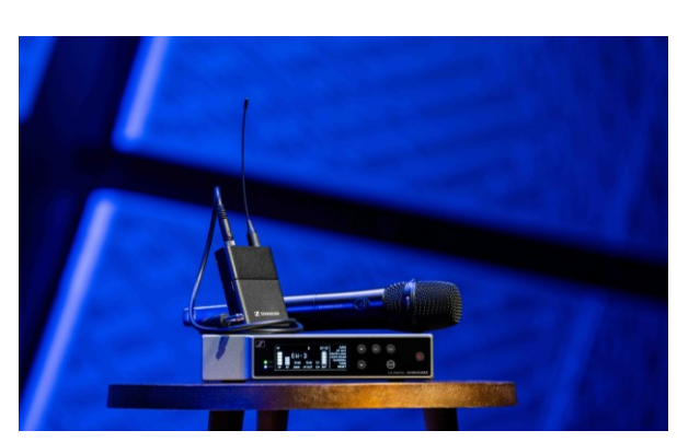
Throughout June, special offers are in place for EW-D wireless systems at participating dealers

Wedemark, 6 June 2025 — Sennheiser's Evolution Wireless Digital EW-D microphone systems have become a staple for bands and performers who value audio quality and UHF reliability. With setup simplicity via the Smart Assist app, operating an Evolution Wireless Digital system is a breeze. For those who have not yet made the switch to digital wireless, the month of June presents an ideal opportunity: Participating Sennheiser dealers will offer discounts on Sennheiser's EW-D wireless microphone and instrument systems between 1 June 2025 and 30 June 2025. As a bonus, and to kick off its 80th anniversary in style, Sennheiser is releasing 80 pairs of special 80th anniversary edition Ruby Red HD 25 headphones. All that participants have to do for a chance to win is share their experience with Sennheiser's professional wireless products here, no purchase necessary.